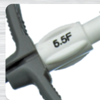
Tearaway introducer available in half-sizes